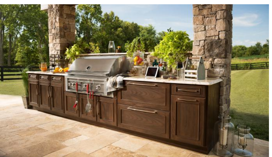
Trex Outdoor Kitchen